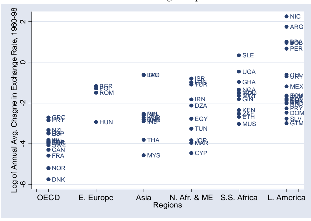
Figure 1. Nominal Instability by Region<sup>1/</sup> A. Large Sample